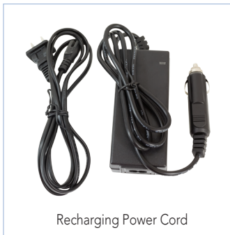
Recharging Power Cord